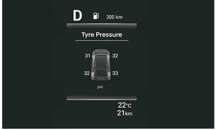
Tyre pressure monitoring system (Highline)

Other features: Strong body structure with AHSS | Electronic stability control (ESC) | Vehicle stability management (VSM) | Hill assist control (HAC)