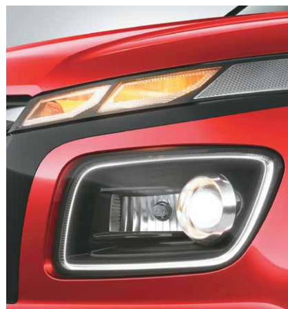
LED projector headlamps

Other features: LED DRL & positioning lamps | Cornering lamps | Headlamp escort function | Chrome finish outside door handles | Roof rails