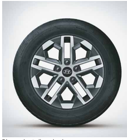
Diamond cut alloy wheels