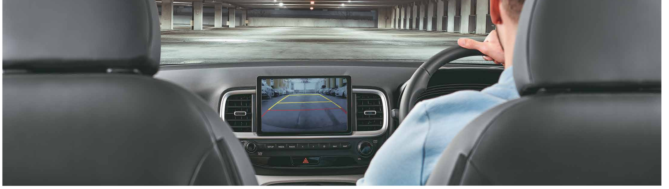
Rear parking assist camera with dynamic guidelines